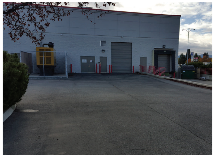
Loading Docks & Gen Set